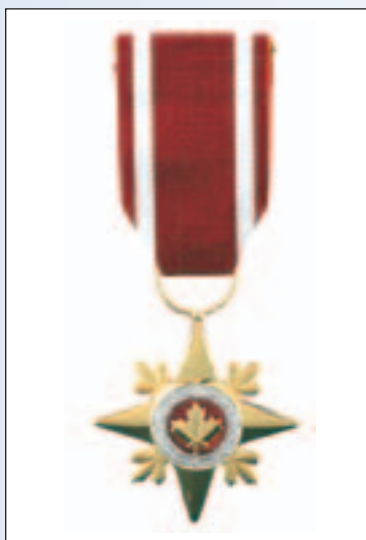
Star of Military Valour