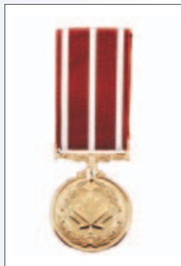
Medal of Military Valour