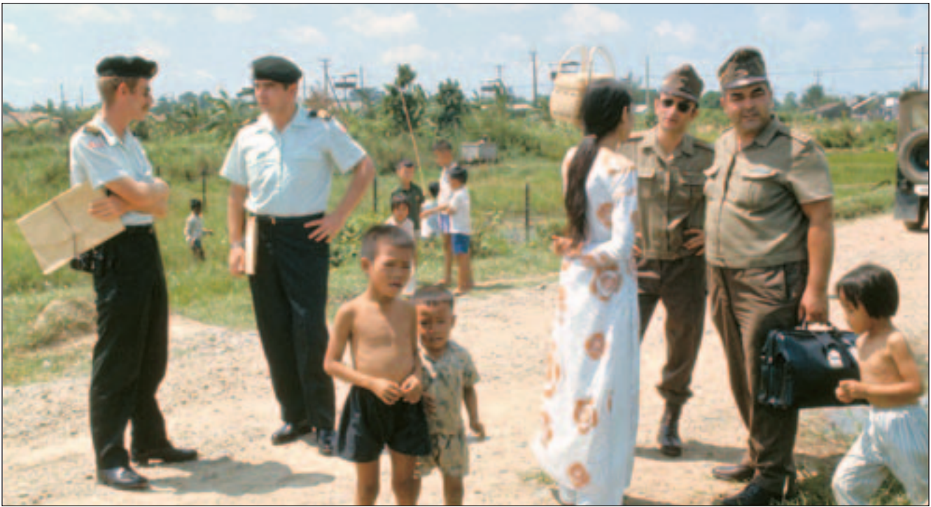
Hungarians and Canadians at Quang-Long, Vietnam, while serving on the International Commission of Control and Supervision (ICCS), 6 January 1973.