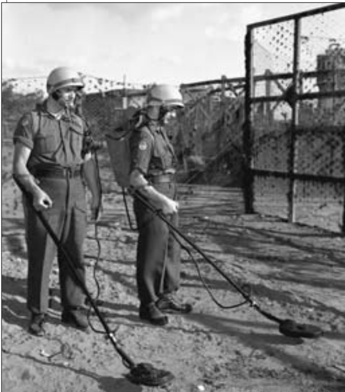
Mine clearing in New Suez, 28 November 1956.

The spark which eventually resulted in the Suez crisis was the nationalization of the Suez Canal by Egypt from its owner Britain in June 1956. Losing control over the canal threatened the strategic interests of the European powers, as the canal provided a fast sea link to Asia and an easy conduit for Middle Eastern oil. 28 When the Israeli army invaded Egypt on 29 October, France and Britain issued an ultimatum, saying that police action was necessary to maintain peace between Israel and Egypt. 29 On 31 October, Louis St. Laurent refused to join the British after a call for allied aid. 30 After abstaining from a vote in the General Assembly condemning the British and the French, Pearson rose to call for the creation of a UN police force large enough to maintain peace while a diplomatic solution could be worked out. 31 Pearson was in an awkward position between the nation’s greatest allies. The Americans condemned the actions of the British and the French, thinking invasion would only cause more problems. 32 However, Pearson felt