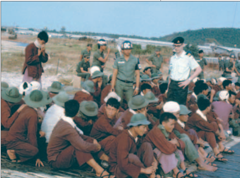
The ICCS at work, Vietnam, 28 May 1973.

When Pierre Trudeau came to power in Canada in 1968, he employed a new rhetoric of independence from American foreign policy. Ironically, Trudeau’s willingness to participate in the 1973 ICCS was a direct continuation of his predecessors’ policies, which aided the Americans.