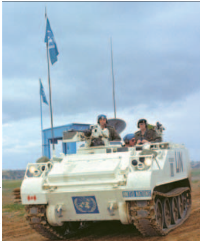
A Canadian Lynx moves past an observation post in the UNFICYP patrol area during February 1976.

The situation in Cyprus was important to Canada because of the strategic situation at the time. The SBAs belonging to Great Britain were used as base sites for both conventional and nuclear weapons. From these bases, nuclear strikes could be launched against the western USSR without having to pass over other Eastern bloc countries, while conventional forces could be deployed throughout the Middle East. 79 More importantly, Greece and Turkey were both NATO allies, 80 especially Turkey, serving as a base for vital military and intelligence posts. A war between these two nations, it was feared, would undermine NATO’s position in the Eastern Mediterranean. 81 Surprisingly, some of Canada’s official reasons for intervening in Cyprus closely match the ‘real’ reasons. In a speech given in May 1964, Paul Martin explained Canada’s position on Cyprus. One theme of his speech closely matched the peacekeeping myth that was traditionally apparent in Canadian statements. The Canadian objective was “...the restoration of order and tranquillity in that island and the maintenance of international peace.” 82 Martin portrayed Canada as a great humanitarian nation as well; the “...suffering of the people of Cyprus...demanded the attention of all who believe in human decency and dignity.” 83 However, Martin admitted that Canada had strategic reasons in mind as